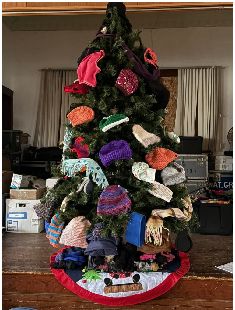
Boone County Pomona Grange