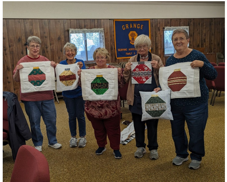
The ladies of Flora Grange's Friday Quilting group show off the Mystery Project completed at November's session. Everyone enjoyed making the Christmas pillow.