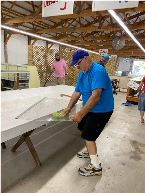
Chip hard at work.