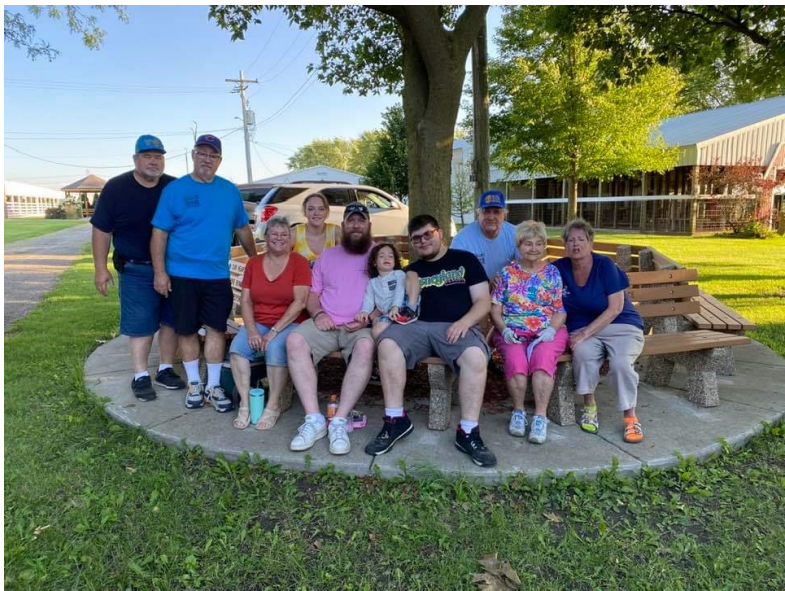
A Beaver Valley/Paulson family work crew