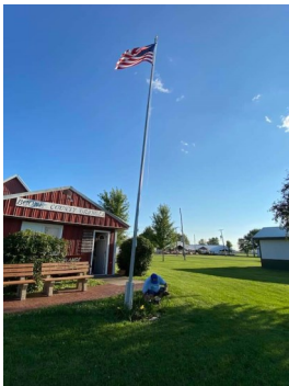
Cleaning up around the Museum, Gazebo and Home Economics building.