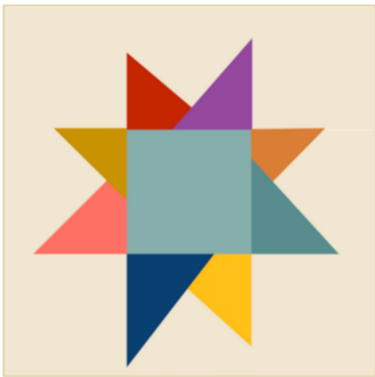
Wonky Star Quilt Block

First, the Unfinished Quilt Block Contest continues under many of the same rules. This year's block pattern is "Wonky Star" and instructions are available at https://ly/22wonkystar courtesy of Swallowtail Quilting Company. Entries will be judged in three categories: Adult, Junior, and Men. Official rules and entry form can be printed from the National Grange Website ( www.nationalgrange.org ).