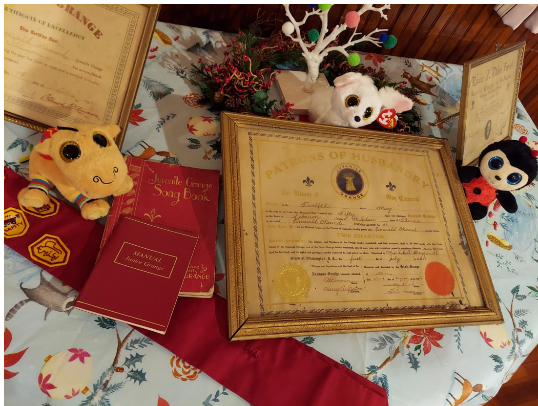
Checking out the Junior display at Emerald Mound Grange 100th Celebration!!