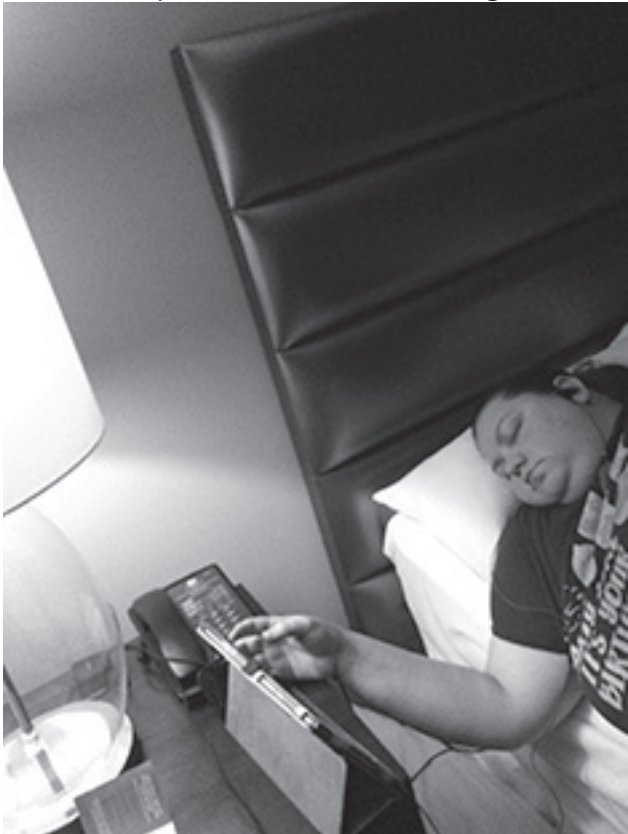
6 February, 2019 Illinois Granger