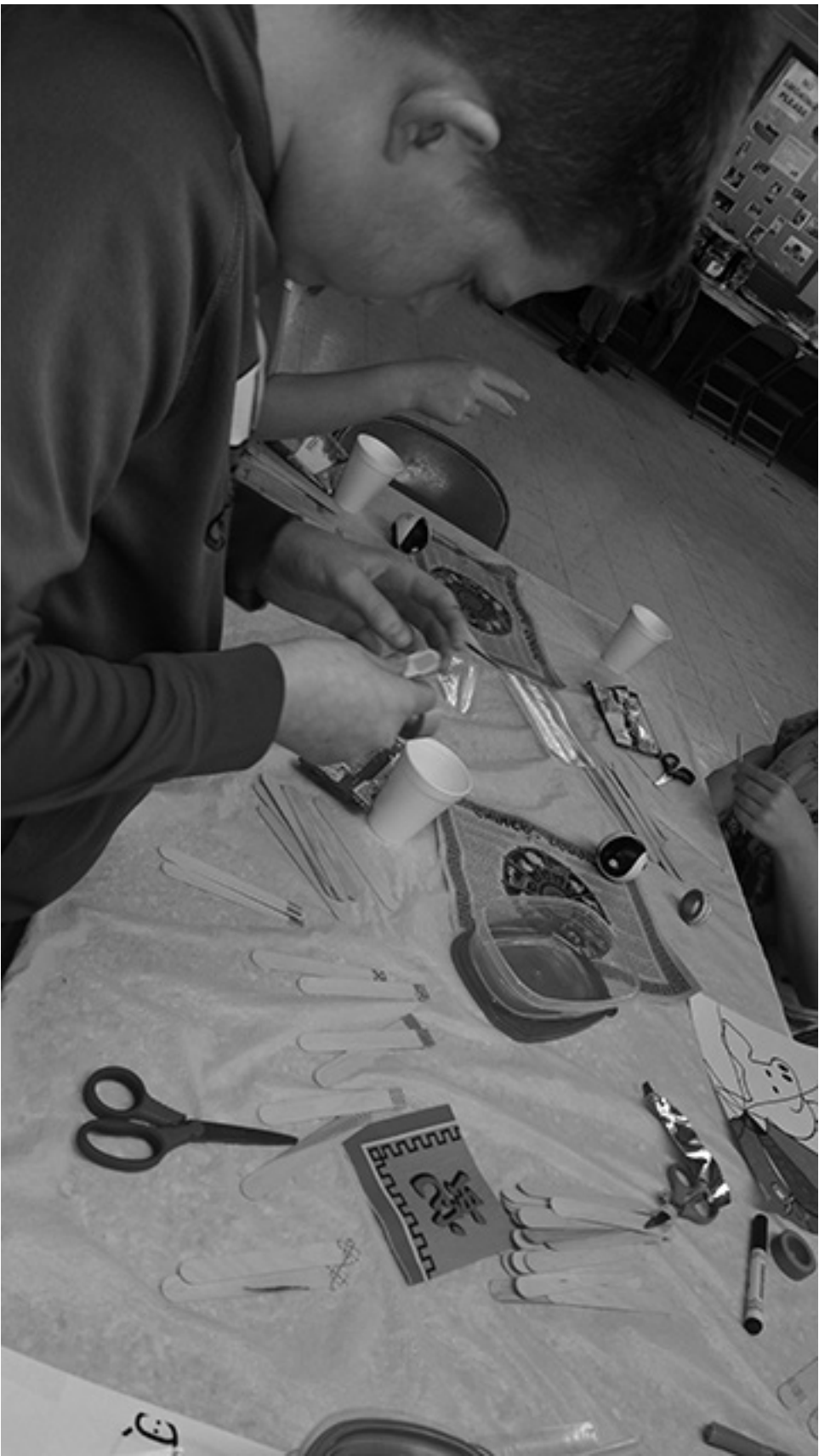
Junior fun at Hopewell Grange