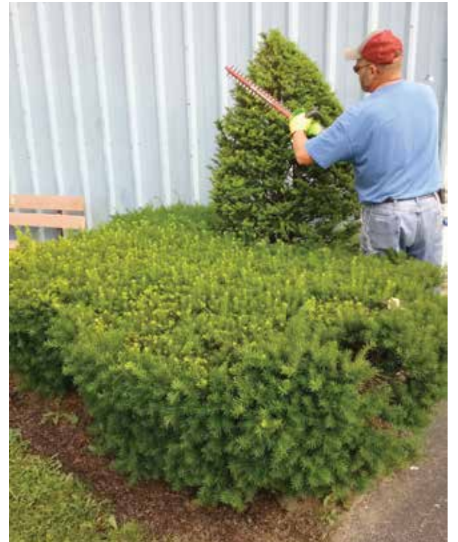
Todd Hegge trimming hedges