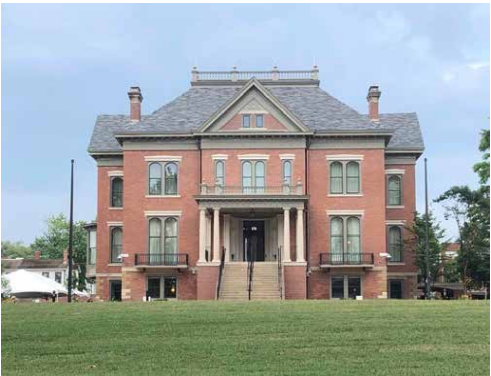
Illinois Governor’s Mansion July 2018